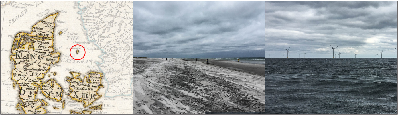
Figure 1: Anholt island's location in the Kattegat Sea (left), the north shore of Anholt island (middle), and the Anholt Wind Farm (right).