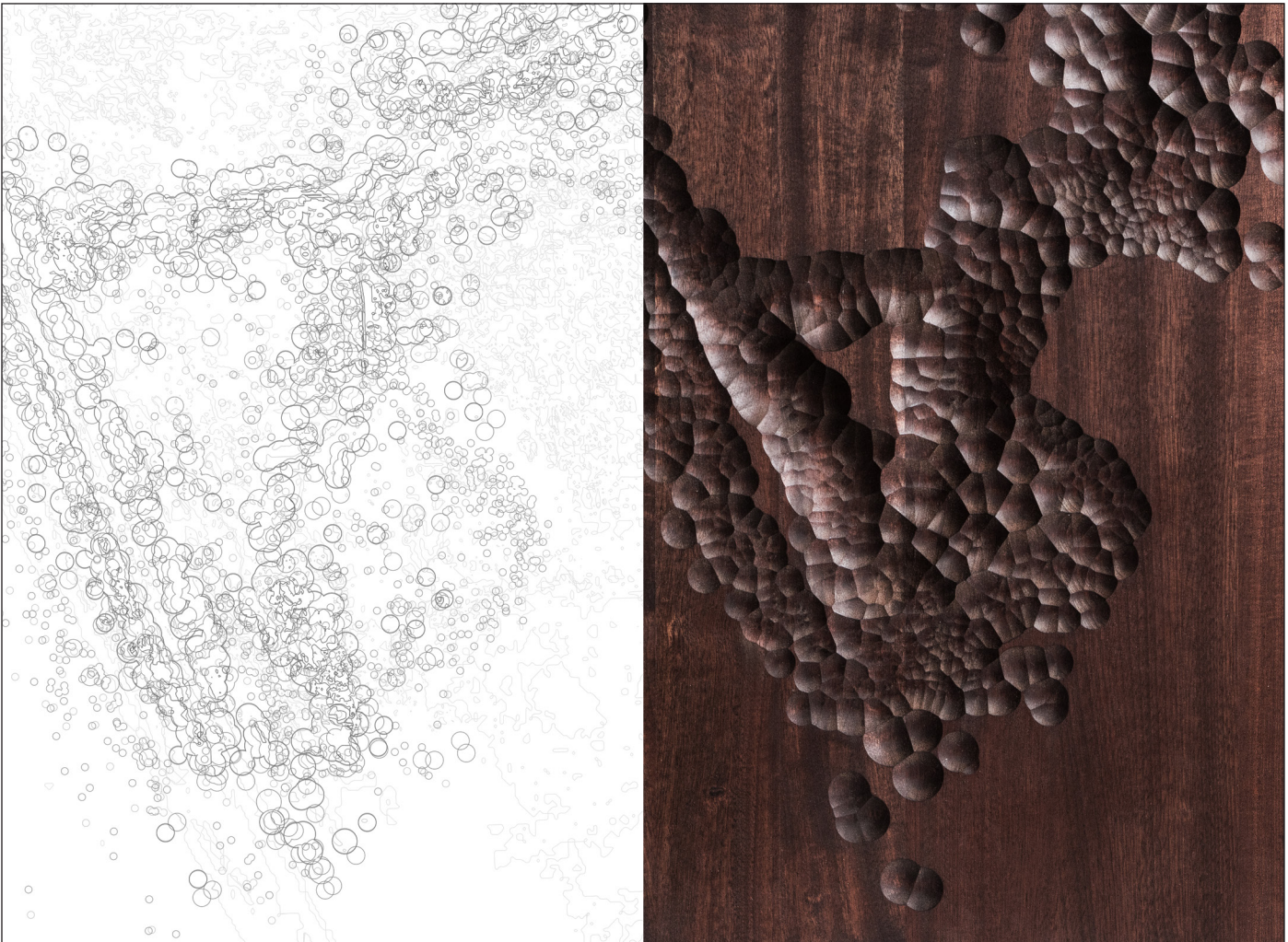
Figure 3: A comparison between the large mapping examining perceived site borders (left) and the evolved Rosetta Stone milling (right). Drawing and milling by Alexander Thorbjørn Fiala Carlsen and Alexandria Bo-Weong Chan.

Zooming in to the region of the site, quantitative research was undertaken to build up the basis for the L mapping. In preparation for the intended site visit, this information was mapped at 1:1000, with the resultant mapping taken to site for further use. The initial quantitative-based L mapping pursued the same geography shaping forces as the XL mapping, with a special emphasis on the wind forces. The impact of the wind on the surface of the Island and redirection of the wind were mapped based on topography and wind data.